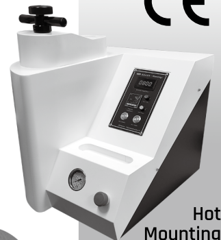
Hot Mounting Machine